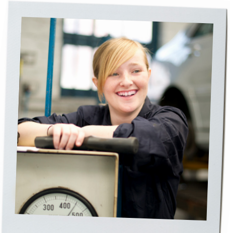
Starting an apprenticeship