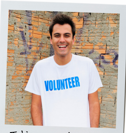
Taking up a volunteering opportunity overseas