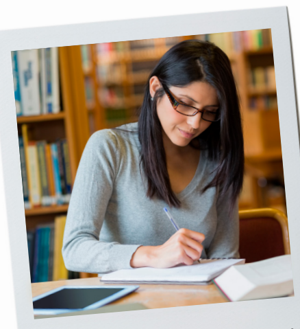
Starting a university course