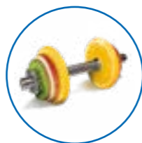
Sport and Exercise Science